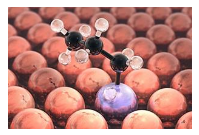
Artistic rendering of the propane dehydrogenation process taking place on the novel single Rhodium atom alloy catalyst, as predicted by theory.

Tufts Researchers at University, University College London (UCL), Cambridge University and University of California at Santa Barbara used guantum chemical simulations run on supercomputers to predict a new catalyst architecture as well as its interactions with certain chemicals, and demonstrated in practice its ability to produce propylene which is critically needed in the manufacture of plastics, fabrics and other chemicals. The improvements have potential for highly efficient, "greener" chemistry with a